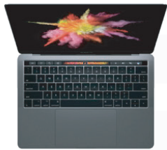
USB-C® Enabled Computer