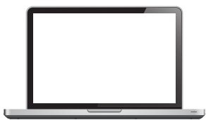
Laptop | PC