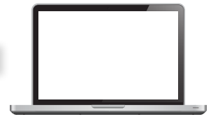
Laptop | PC