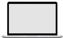
Laptop | PC