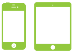
USB-C™ MOBILE / TABLET / COMPUTER