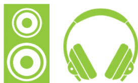
3.5MM HEADPHONE / SPEAKER