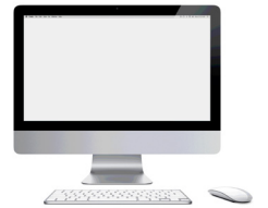
Monitor | Keyboard | Mouse

Cadyce's KVM cables are available in various lengths, i.e. 1.8 meter, 3 meter and 5 meter. These KVM cables are compatible with 8 port Rack mount KVM switch (CA-UK800) and 16 Port Rack mount KVM switch (CA-UK1600).